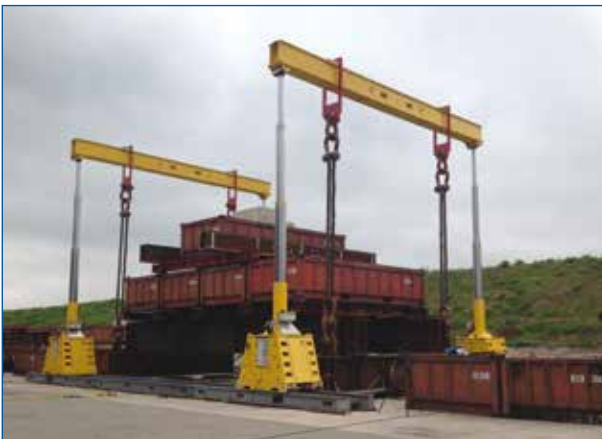
◀ SL-400 Series Gantry during load testing.